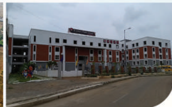
ST.JOHN'S PUBLIC SCHOOL