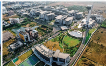
SIPCOT IT PARK