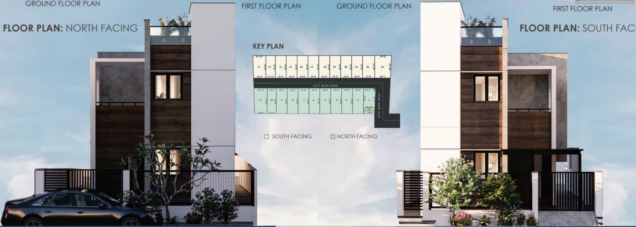
FLOOR PLAN: SOUTH FACING