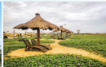
KOVALAM BLUE FLAG BEACH